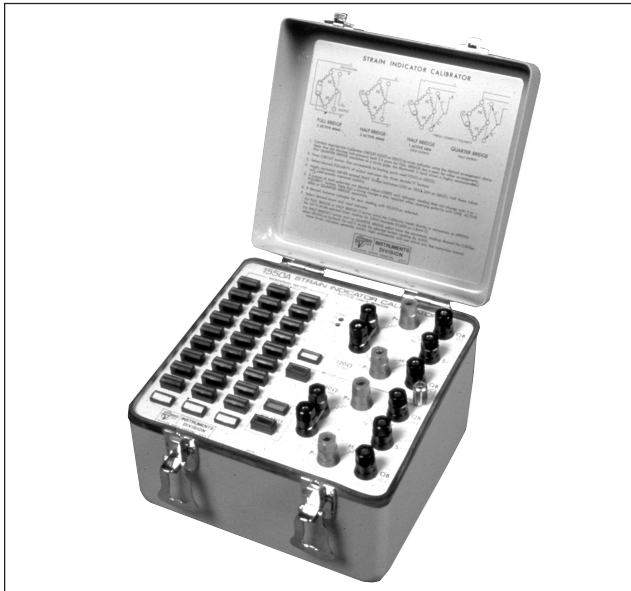
A laboratory standard for verifying the calibration of strain and transducer indicators.